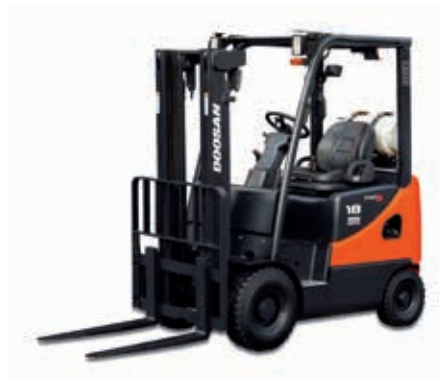
G15S / G18S-5 & G20SC-5 1,500kg 1,750kg 2,000kg LPG, Pneumatic Tire