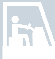
Operator Sensing System (OSS)