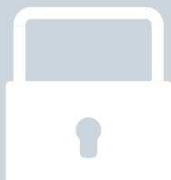
Lift and tilt locking hydraulic valve