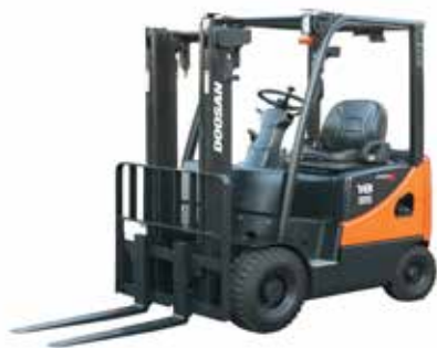
D15S / D18S-5 & D20SC-5 1,500kg 1,750kg 2,000kg Diesel, Pneumatic Tire