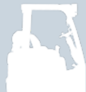
Refined operator compartment